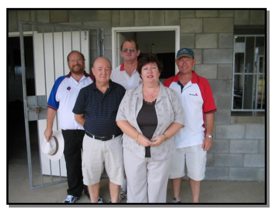
Life Members help out on Trophy Day!