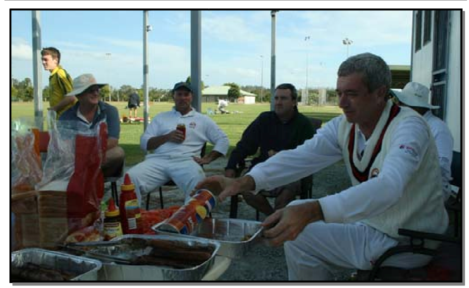
Relaxing after the match'