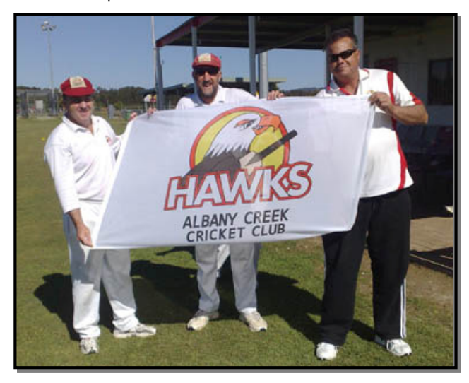
The Hawk's Flag