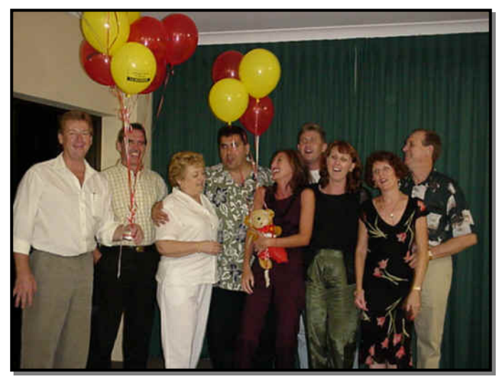
Some of the revellers at the 10 Year Anniversary Dinner

We are always interested about hearing the history of our club. If you can supply additional information, or have reason to dispute any of the information listed, please contact us on mailto:accc@albanycreekcricketclub.com.