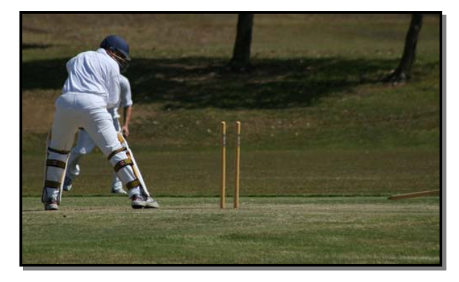
....and that's OUT!'