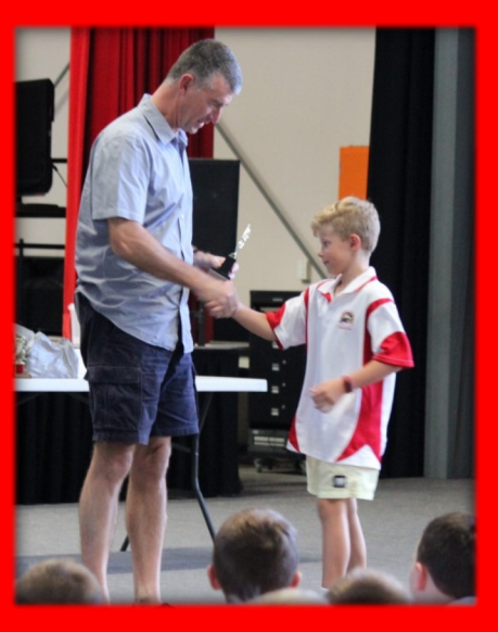
Congratulations to all Award Recipients