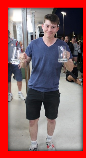
Congratulations to all Award Recipients