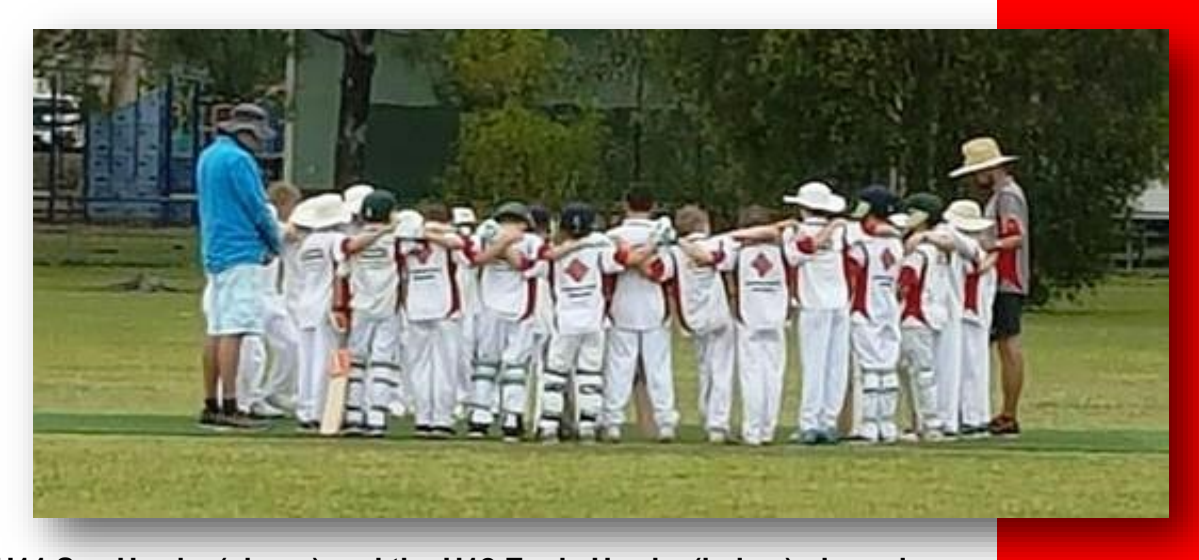
U11 Sea Hawks (above) and the U12 Eagle Hawks (below) observing a Minute of Silence to remember the Fallen from all Wars and Armed Conflicts — Lest We Forget!