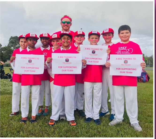
UIO Grey Hawks