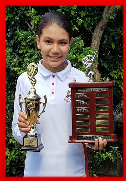
Female Cricketer of the Year 2020-21 Under 13 Diamond Hawks