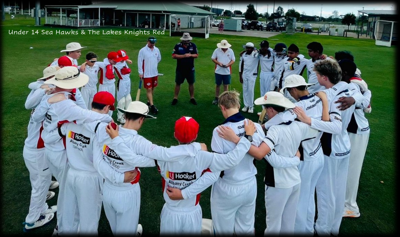
Under 14 Sea Hawks & The Lakes Knights Red

Our thoughts are with the bowler who delivered the ball that caused the fatal injury.