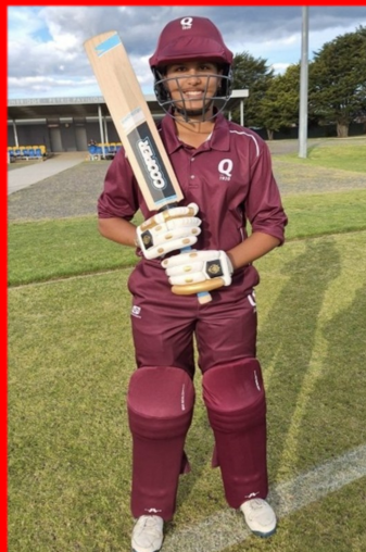
2025 10-12 Years Girls Queensland Representative School Sport Cricket Team