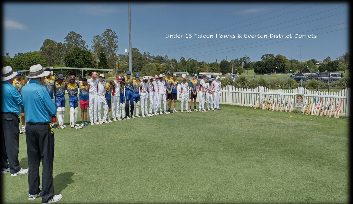
Under 16 Falcon Hawks & Everton District Comets